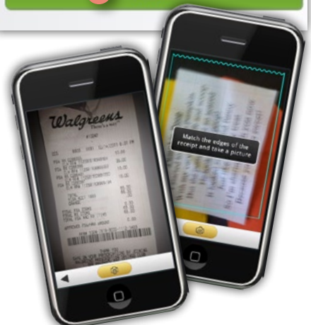
File A Claim Screen